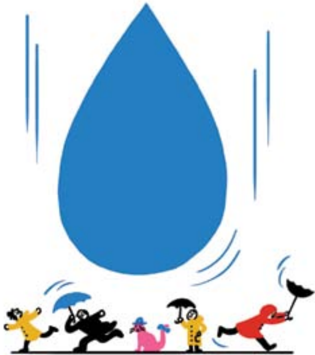
La Gota Roja by Olga Capdevila

By opening this book the reader has to be ready to start on a journey through words! The reader will for instance have to remove all vowels from a proposed set of words and replace them by others to create a different set of words. An extremely funny anthology of verbal experiments! The witty illustrations are the perfect complement of the texts. A book that will make you play with words, their shape, their meaning and sound, as if following on the steps of a detective and his hound trying to solve the mystery of the language.