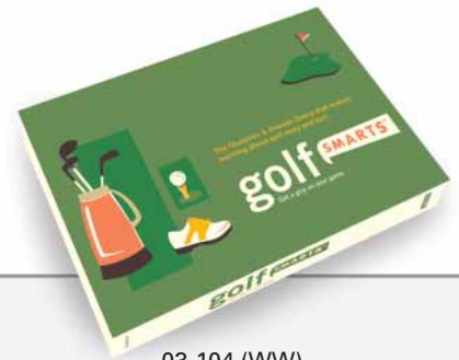
03-104 (WW) GolfSmarts UPC 184709031043