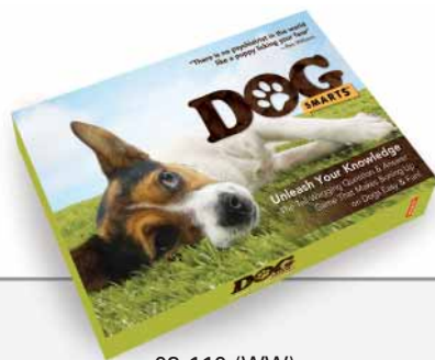
03-110 (WW) DogSmarts 2.0 UPC 184709031104