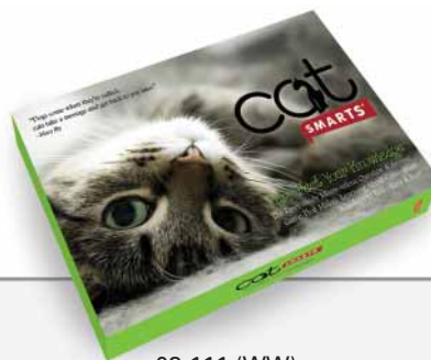
03-111 (WW) CatSmarts UPC 184709031111