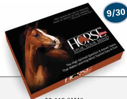
03-118 (WW) HorseSmarts UPC 184709031180