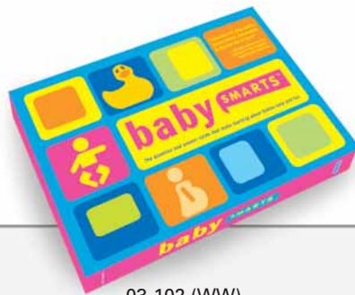
03-102 (WW) BabySmarts UPC 184709031029