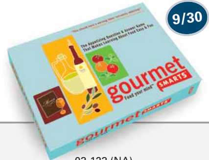
03-123 (NA) GourmetSmarts 2.0 UPC 184709031234