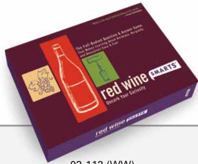
03-112 (WW) RedWineSmarts UPC 184709031128