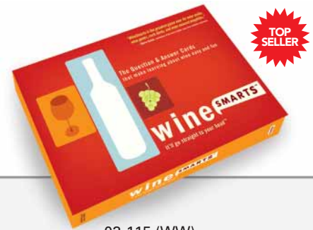
03-115 (WW) WineSmarts UPC 184709031159