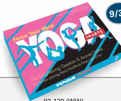
03-120 (WW) YogaSmarts UPC 184709031203