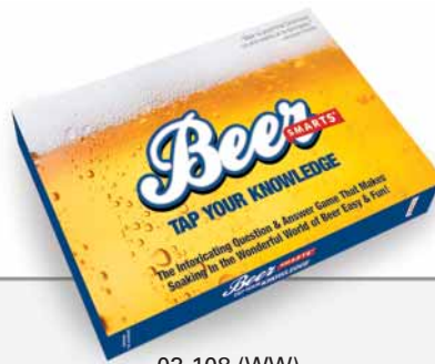
03-108 (WW) BeerSmarts 2.0 UPC 184709031081